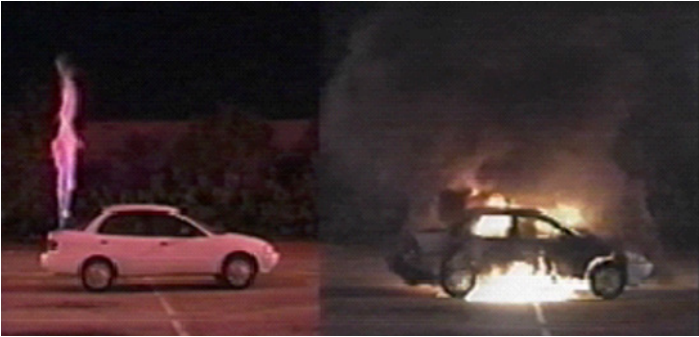
Photo from a video that compares fires from an intentionally ignited hydrogen tank release to a small gasoline fuel line leak.

Hydrogen is no more or less dangerous than other flammable fuels. However, its unique characteristics should be viewed as advantageous. Hydrogen is lighter than air and therefore it rapidly disperses in the event of a leak. This minimizes the possibility of accumulation and ignition. In the event that hydrogen does ignite, its flames generate low radiant heat due to the absence of carbon. This makes hydrogen substantially safer than conventional hydrocarbon fuels (such as gasoline) for users and first responders in the event of any accident.